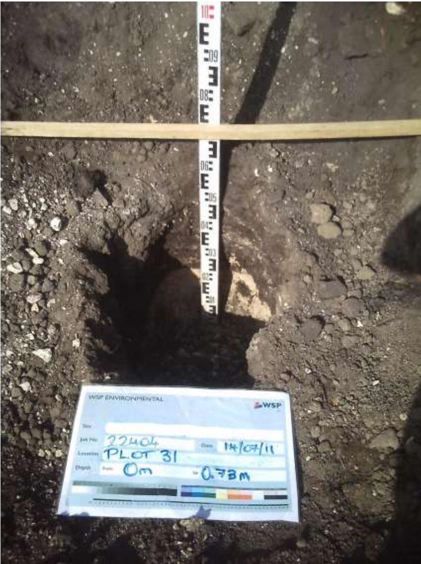
Photograph 1: Depth check of inert cover within area of public open space. Physical break layer and topsoil visible.