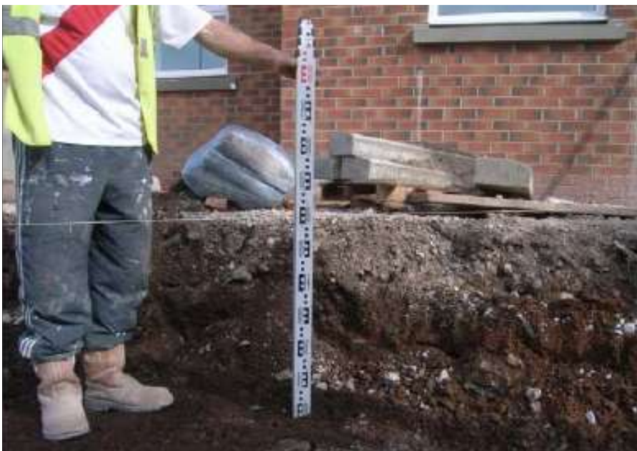
Photograph 4: Depth check of inert cover within areas of front gardens.