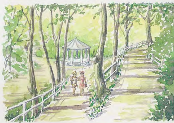
Hazel Grove, Saltburn - c.1920

There are Bronze Age burial mounds on Eston Moor and in Errington Woods, along with many reminders of the area's mining history. There are also some wonderful views of the coast from several points along the top of Errington Woods. Hazel Grove was bequeathed to the people of Saltburn in 1896 by the Marquis of Zetland.