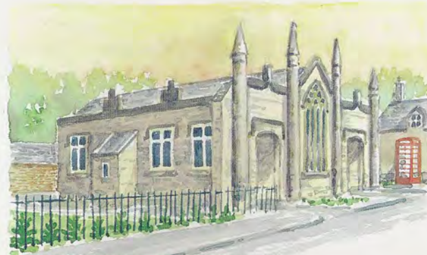
Old School House, Wilton Village