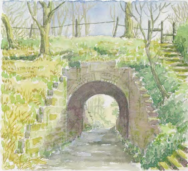
The 1871 Bridge

Please come equipped for changeable weather and muddy paths with waterproofs and strong walking boots. Allow about six hours for your walk. Please take care when near to roads and keep dogs on leads through farmland, traffic and built-up areas.