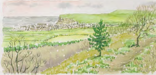
Huntcliff from Errington Woods

The Tees Forest team is working towards a long term vision of the countryside around Teesside's towns and villages, in partnership with local authorities, private landowners and community groups. The end result will be a well wooded landscape for wildlife, work, recreation and education that benefits the local economy. The result of this action is already apparent and will further develop in years to come.