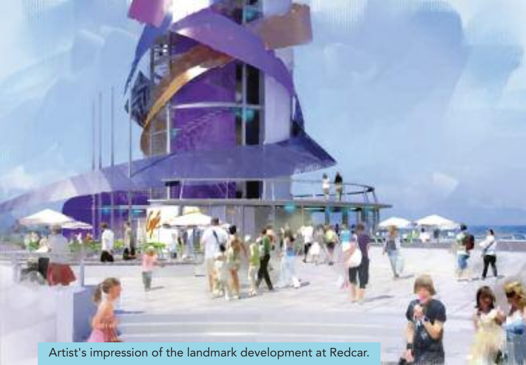
Artist's impression of the landmark development at Redcar.