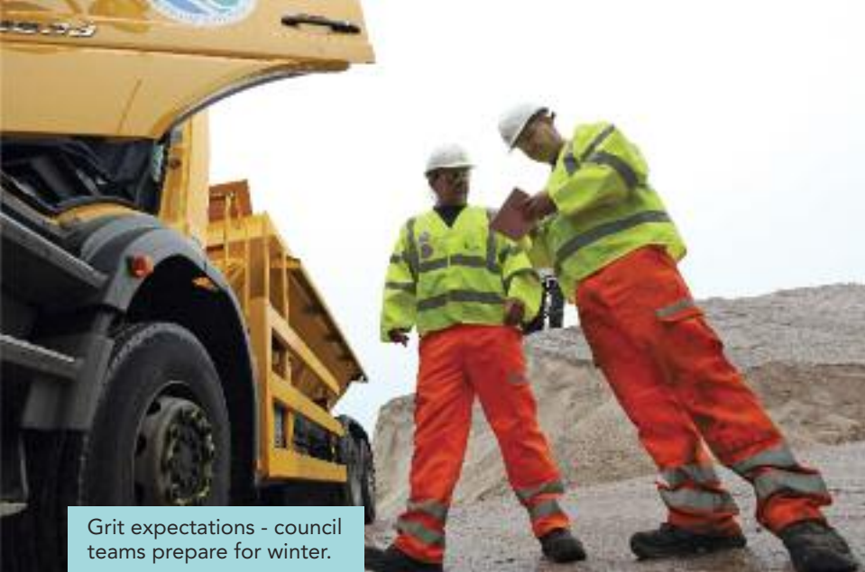
Grit expectations - council teams prepare for winter.