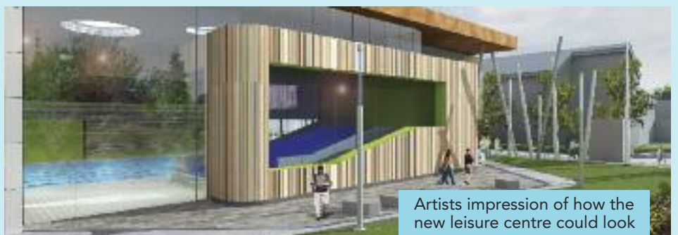
Artists impression of how the new leisure centre could look

As well as providing an array of sporting facilities, the Redcar Leisure and Community Heart development, between Kirkleatham Street and Coatham Road, will also include business space, community facilities, car parking and landscaped public spaces.